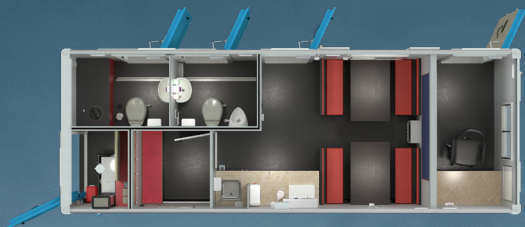
3. UNISEX TWIN TOILETS UNIT