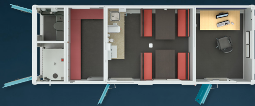
1. RECIRCULATING TOILET UNIT