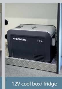
12V cool box/ fridge