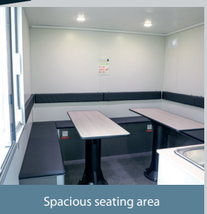
Spacious seating area