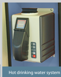
Hot drinking water system