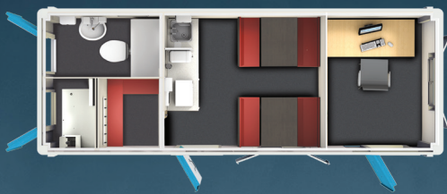
2. FULL-FLUSH TOILET UNIT