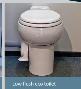
Low flush eco toilet