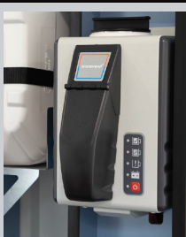
Hot drinking water system