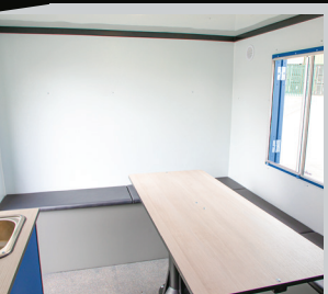
Spacious seating area