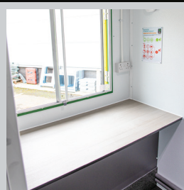
Separate office space