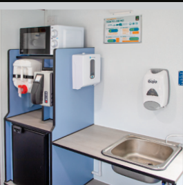
Well equipped canteen