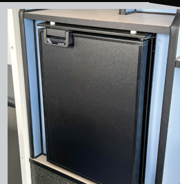
12V fridge (optional)

Innovative, functional, environmentally efficient and cost effective.