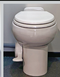
Low flush eco toilet