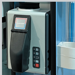
Hot drinking water system