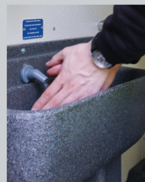
Delivery of hot water