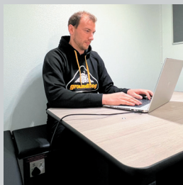
Inverter powered USB sockets