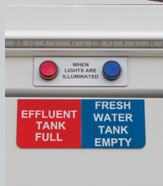
LED tank indicators

Innovative, functional, environmentally efficient and cost effective.