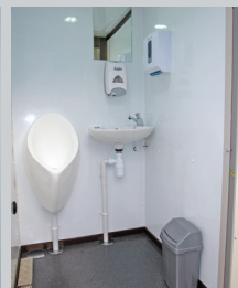
Male Toilet Area