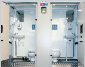
Separate Unisex Toilet Areas