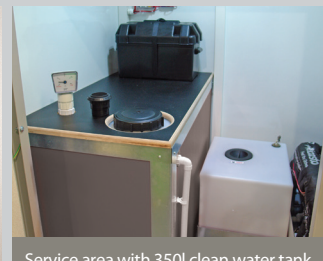
Service area with 350l clean water tank and 65l heating fuel tank