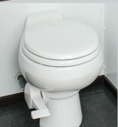
Low flush eco toilet

Robust & easy-to-use toilet unit - ideal for construction, rail, utility and hire industries.