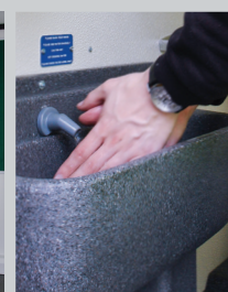
Delivery of hot water