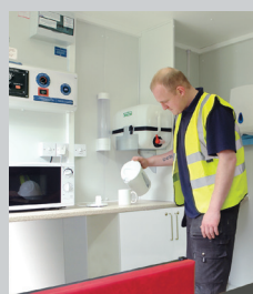
Well equipped canteen