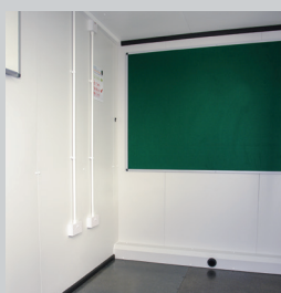
Separate office space