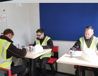
Seating area for up to 8 people