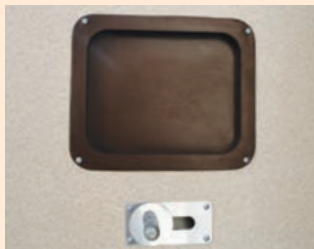
High secure double lock door with integral window and vent