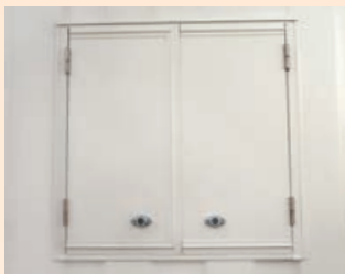
High security window shutters