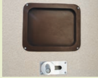
High secure double lock door with integral window and vent