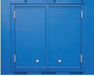
High security window shutters