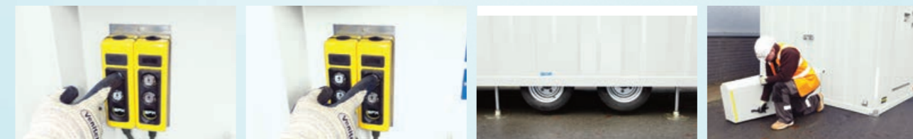
Push button controls to lower front and rear hydraulic rams

Easily towed, one man operation secured and manoeuvred on site. Its many safety features make it a high secure and money saving choice of welfare unit for rental companies and contractors.