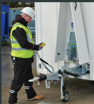
Unhitch from towing vehicle and operate hydraulics using the push button controls

Fast deployment time means more time on the job, making it the money saving choice of welfare unit for rental companies and contractors.