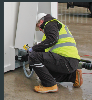
Lower unit to the ground and unplug controls