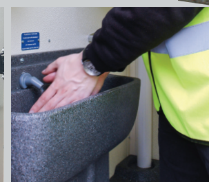
Delivery of hot water