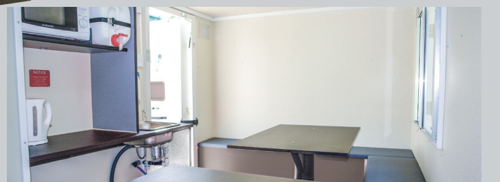
Well equipped canteen and seating area for up to 12-14 people