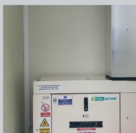
Warm room/ Generator area