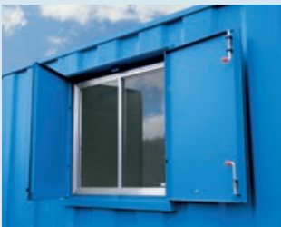
High security window shutters