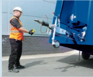
Lower unit to the ground and unplug controls