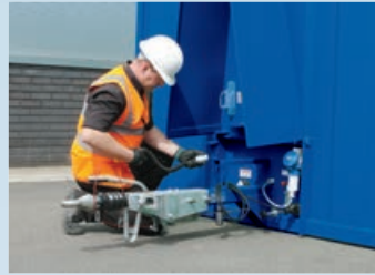
Close & lock canopy to protect towing facility